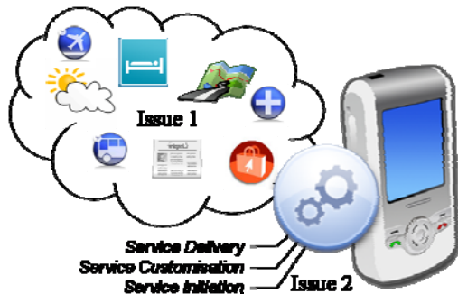
Figure 1. Overall View of our Evaluation Framework

services are designed and delivered to tourists in order to generate value proposition and user satisfaction. This issue covers the dimensions service delivery (depicting the services' functionalities), service customization (in terms of adaptation to context) and service initiation (characterizing the mode of delivery).